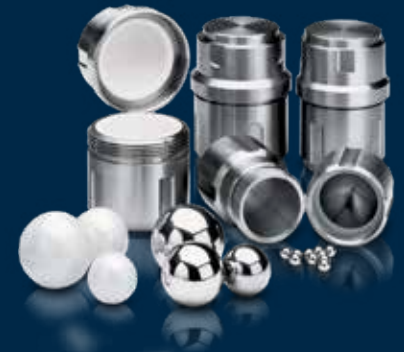
Accessories for MM 500 vario – Adapter for single-use vials

The MM 500 vario can be equipped with screw-top grinding jars from 1.5 ml to 50 ml. Available materials include hardened steel, stainless steel, tungsten carbide, agate, zirconium oxide, PTFE.